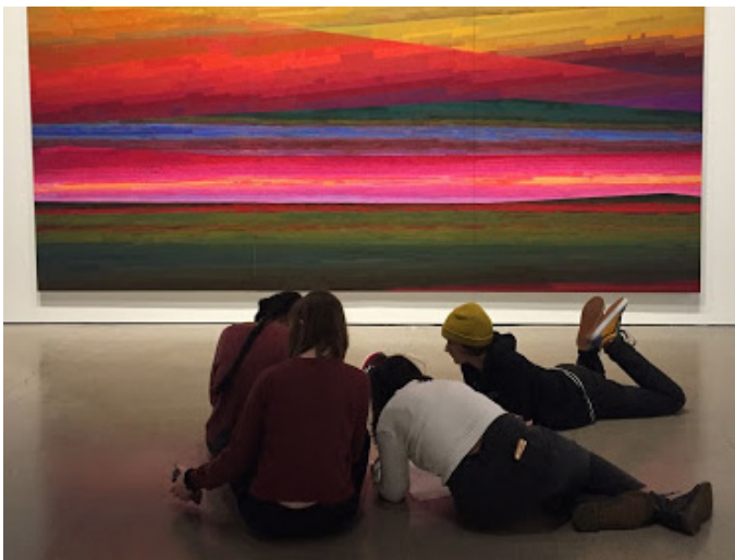
Installation view: Liu Wei, Invisible Cities , moCa Cleveland, 2019

Sometimes, giving students less information about a work of art can lead to deeper discussion. It can be helpful to be selective and intentional about the information you share with students.